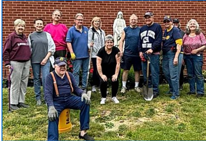
Rotarians landscaped the grounds of St. Anne's Center, Roseberry Street, on May 20, 2023.

Becoming a member enables you to meet your community's leaders and to make an impact both here and around the world. We invite you to visit our club and find out more about us and the opportunities we offer to get involved. Our members have found that it's a truly rewarding experience.